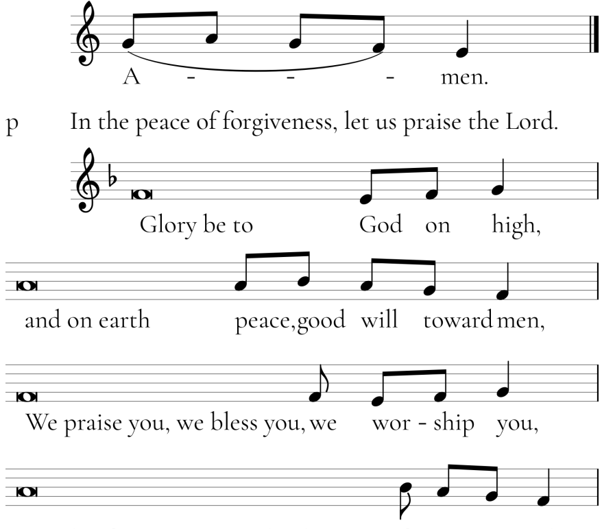
we glorify you, we give thanks to you, for yourgreatglory

p God, our heavenly Father, has been merciful to us and has given His only Son to be the atoning sacrifice for our sins. Therefore, as a called servant of Christ and by His authority, I forgive you all your sins in the name of the Father and of the Son and of the Holy Spirit.