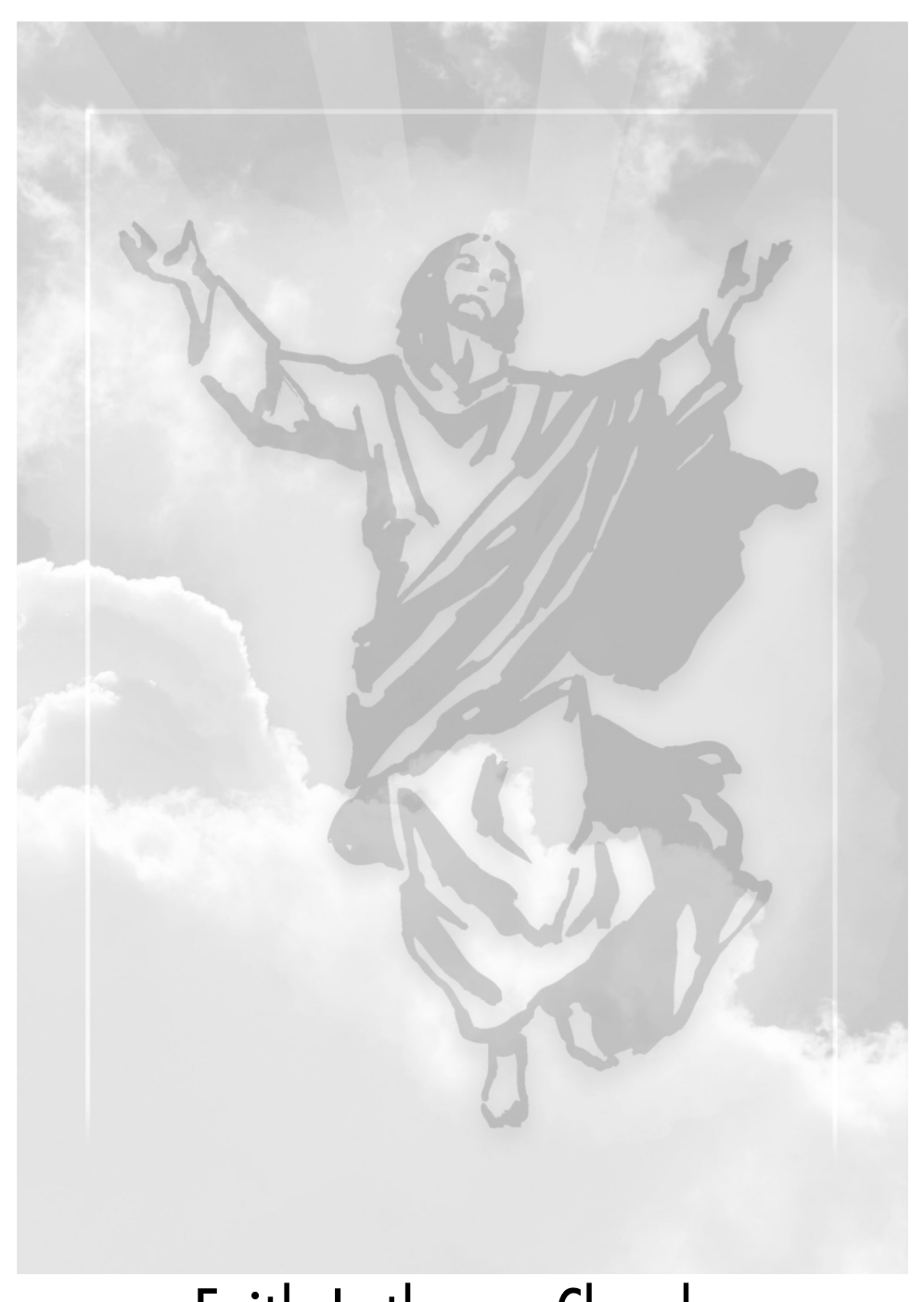
Faith Lutheran Church Ascension - May 9<sup>th</sup> 2024