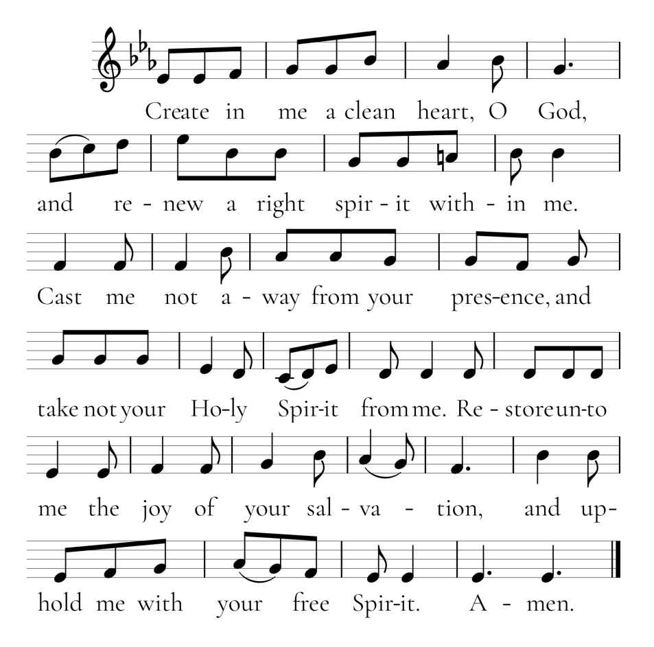
#58:1-4 O Lord, How Shall I Meet thee OFFERING #572:4

As Thy prospering hand hath blest, May we give Thee all our best And by deeds of kindly love For Thy mercies grateful prove, Singing thus through all our days Praise to God, immortal praise.