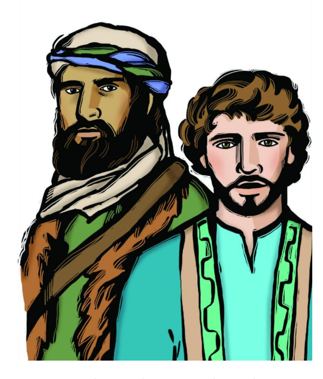
Faith Lutheran Church February 5<sup>th</sup> 2023