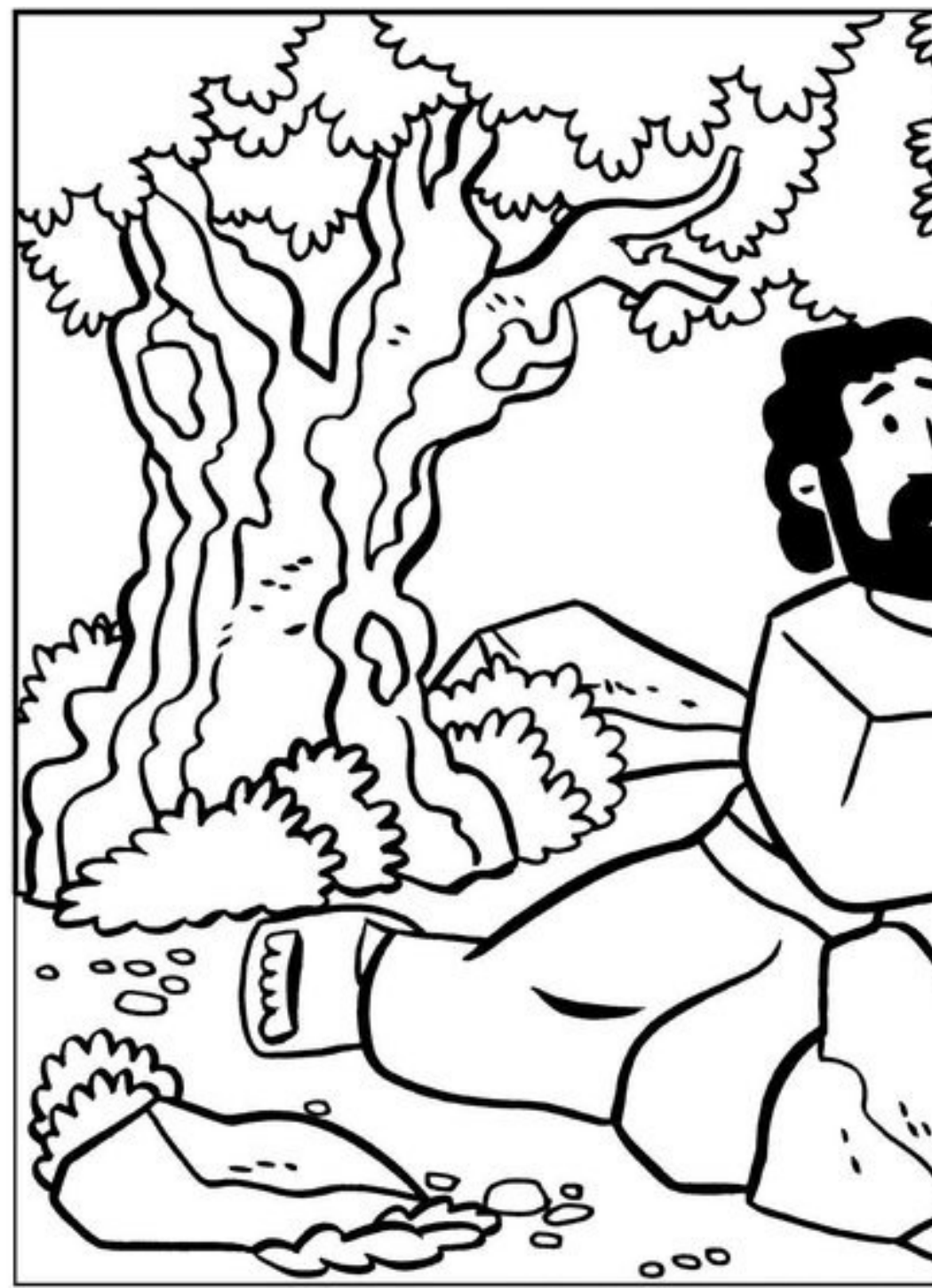
S&S link: Christian Life and Faith: Biblical an Written and illustration Featured on My Wonder Studio. Copyright